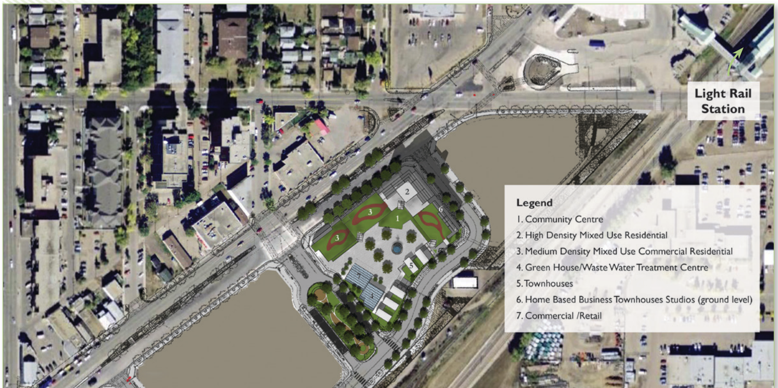
Site plan and urban context. Image courtesy of Hartwig Architects Inc.

Since the project is in the planning phase, the initiative-funded work focuses on consultation/alignment, analysis and design for performance improvements. This includes consultation with approval authorities on the proposed water re-use options and alignment with the community and future residents. Analysis and design improvements are in areas that include: renewable and waste energy use at the neighbourhood scale; green financing options; and options for on-site collection, treatment and use of rainwater and wastewater.